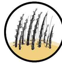
BEAVER fibers bind securely to your thin hair for a full, natural look