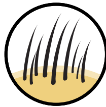
Normal thin hair